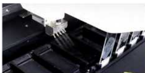
Micro-chamber Blow Dry