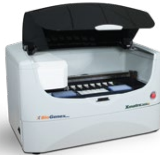
Xmatrix® NANO VIP Fully Automated System for medium throughput labs