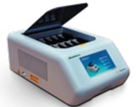
Xmatrix® MINI Manual System for medium and small throughput labs