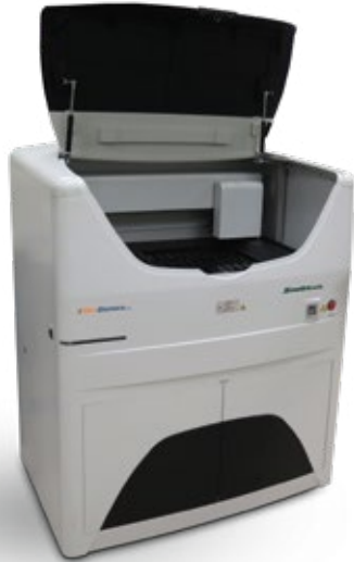
Xmatrix® Ultra Fully Automated System for high throughput labs